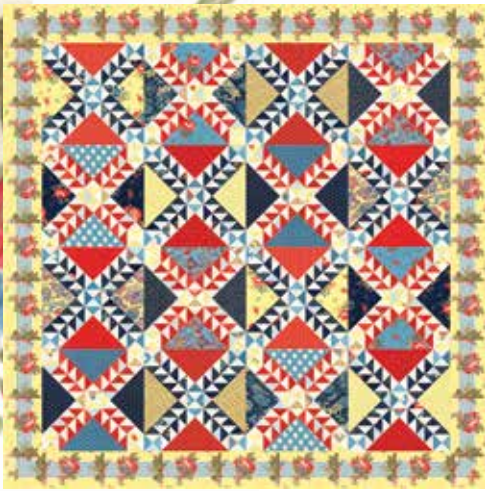
MS 1702 / MS 1702G Lady of the Lake Size: 80" x 80"

Ann's Arbor pays homage to our hometown of Ann Arbor, Michigan. This vintage Americana-inspired color palette evokes happy memories of family and friends, childhood adventures and carefree summers. We've mixed pretty florals, ditsy prints, posies and our favorite paisleys with stripes and diamonds to make a collection suited to any kind of quilt.