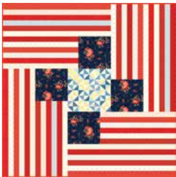
MS 1703 / MS 1703G Four Flags Size: 64" x 64"