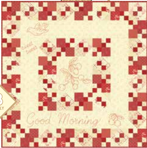
MS 1705 / MS 1705G Good Morning Size: 32" x 32"