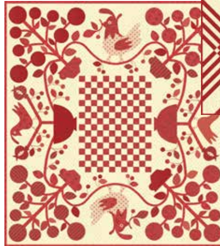
MS 1704 / MS 1704G Birds Hill Lane Size: 36" x 40"

Red and cream. It's as warm, fresh and inviting as a morning spent on the porch with a cup of tea or coffee. Shades of cream from ivory to wheat are mixed with vintage-inspired reds to create a collection that is both classic and trendy. From catalogs to magazines, farmhouse style and red accents remain popular and sought-after. So put some color in your life with quilts and projects made with Farmhouse Reds.