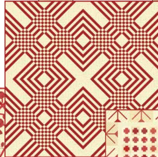
MS 1706 / MS 1706G Mrs. Rose's Best Size: 62" x 62"

Red and cream. It's as warm, fresh and inviting as a morning spent on the porch with a cup of tea or coffee. Shades of cream from ivory to wheat are mixed with vintage-inspired reds to create a collection that is both classic and trendy. From catalogs to magazines, farmhouse style and red accents remain popular and sought-after. So put some color in your life with quilts and projects made with Farmhouse Reds.