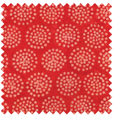
Nº 43035 86 Cherry Red