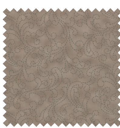
Nº 43024 17* Nickel