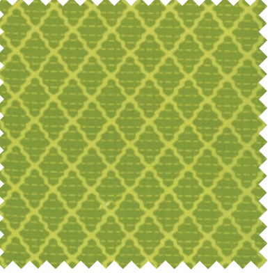
Nº 43026 14 Willow Sprigs