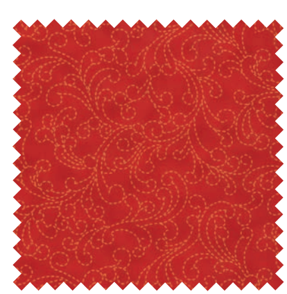
Nº 43024 12 Cherry Red