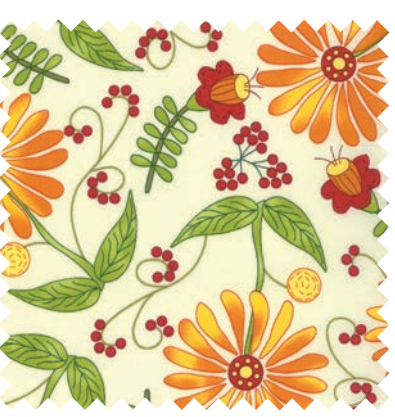
Nº 43020 11* Fresh Linen