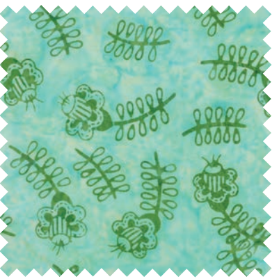
№ 43034 73 Barely Blue