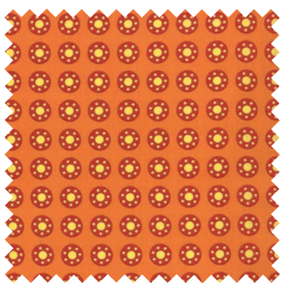
№ 43023 13* Tangy Orange