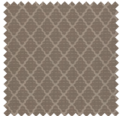
Nº 43026 17 Nickel