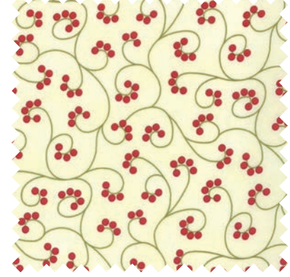
Nº 43021 11* Fresh Linen

customers to listen on their electronic equipment: computer, iPad, MP3, or iTunes. I interview designers and authors who share loads of great tips. These are all things that are FREE to you and build great excitement about new books, new fabrics, as well as new designers.