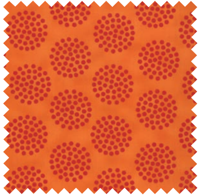
№ 43022 13 Tangy Orange