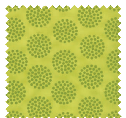
№ 43022 25* Willow Sprigs