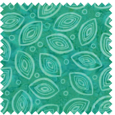
Nº 43033 60 Agean Blue