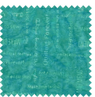
Nº 43030 11 Agean Blue