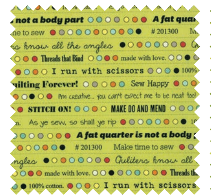
№ 43025 14* Willow Sprigs