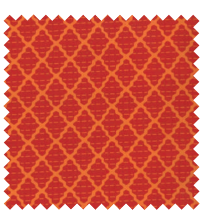
Nº 43026 20* Cherry Red