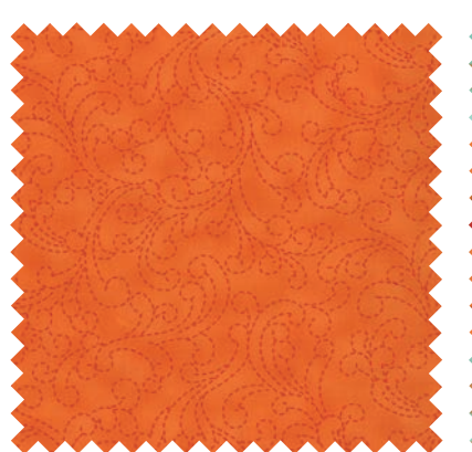
№ 43024 13* Tangy Orange