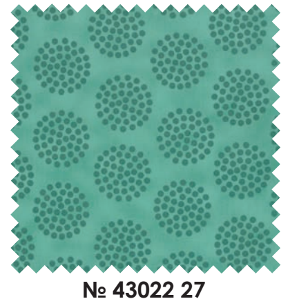
№ 43022 27 Aegeon Blue