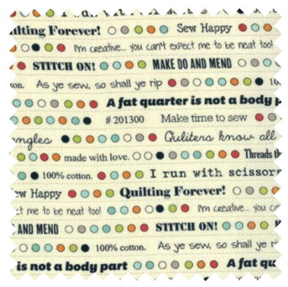
Nº 43025 11* Fresh Linen