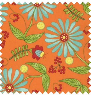
№ 43020 13 Tangy Orange