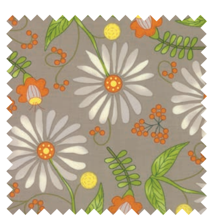
Nº 43020 17* Nickel