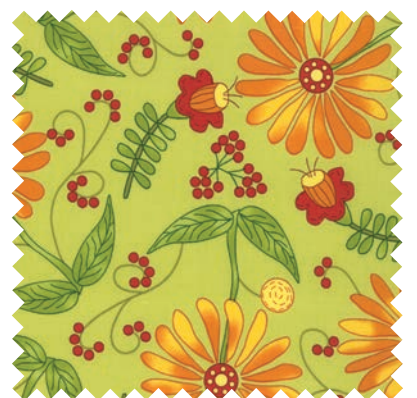
Nº 43020 14 Willow Sprigs