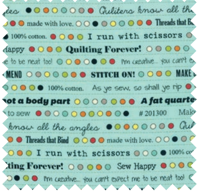
№ 43025 15 Aegeon Blue