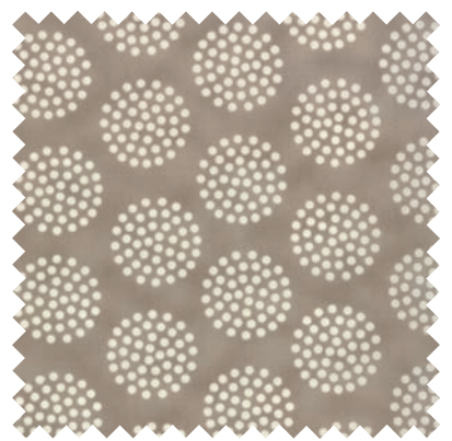
Nº 43022 30* Nickel