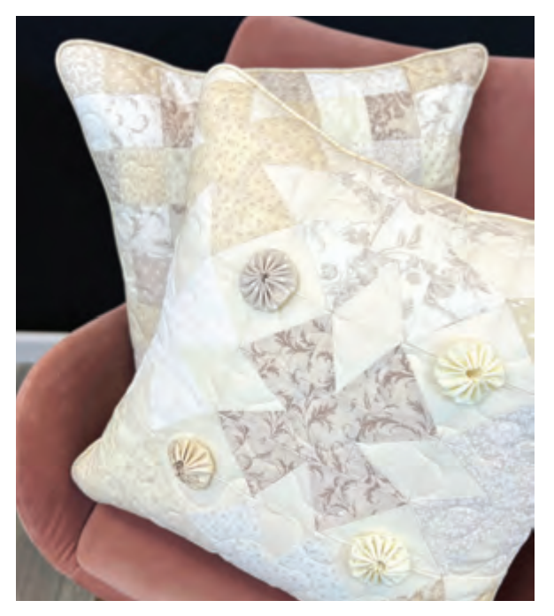
MOD 113 Gentle Kisses quilt 50" x 62" and pillow 18" x 18"

Imagine wandering through a French antique market with the 3 Sisters. You stop by a table laden with stacks of vintage linens salvaged from old manors across the continent. As you rifle through the folded prints, you find delicate linen cloths printed with etched floral toiles, dainty vines, ornamental flourishes, charming ditsies, and playful polka dots - all in faded, tea-stained hues. Each one is a treasure in itself, but when you put them all together — you've curated the 3 Sisters Favorites Vintage Linens collection! Use these linen-inspired prints to make bags and home decor projects with an air of casual European elegance, or incorporate them into your quilts and pillows when you need sophisticated low volumes.