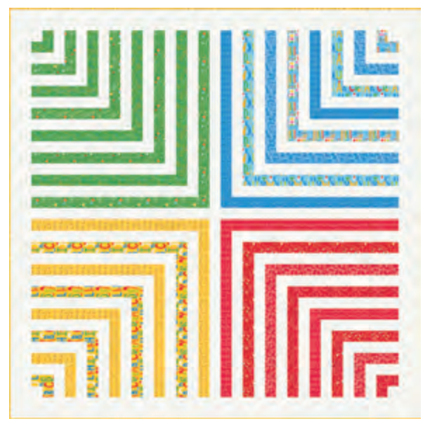
SIH 098 Color Block | 74" x 74"