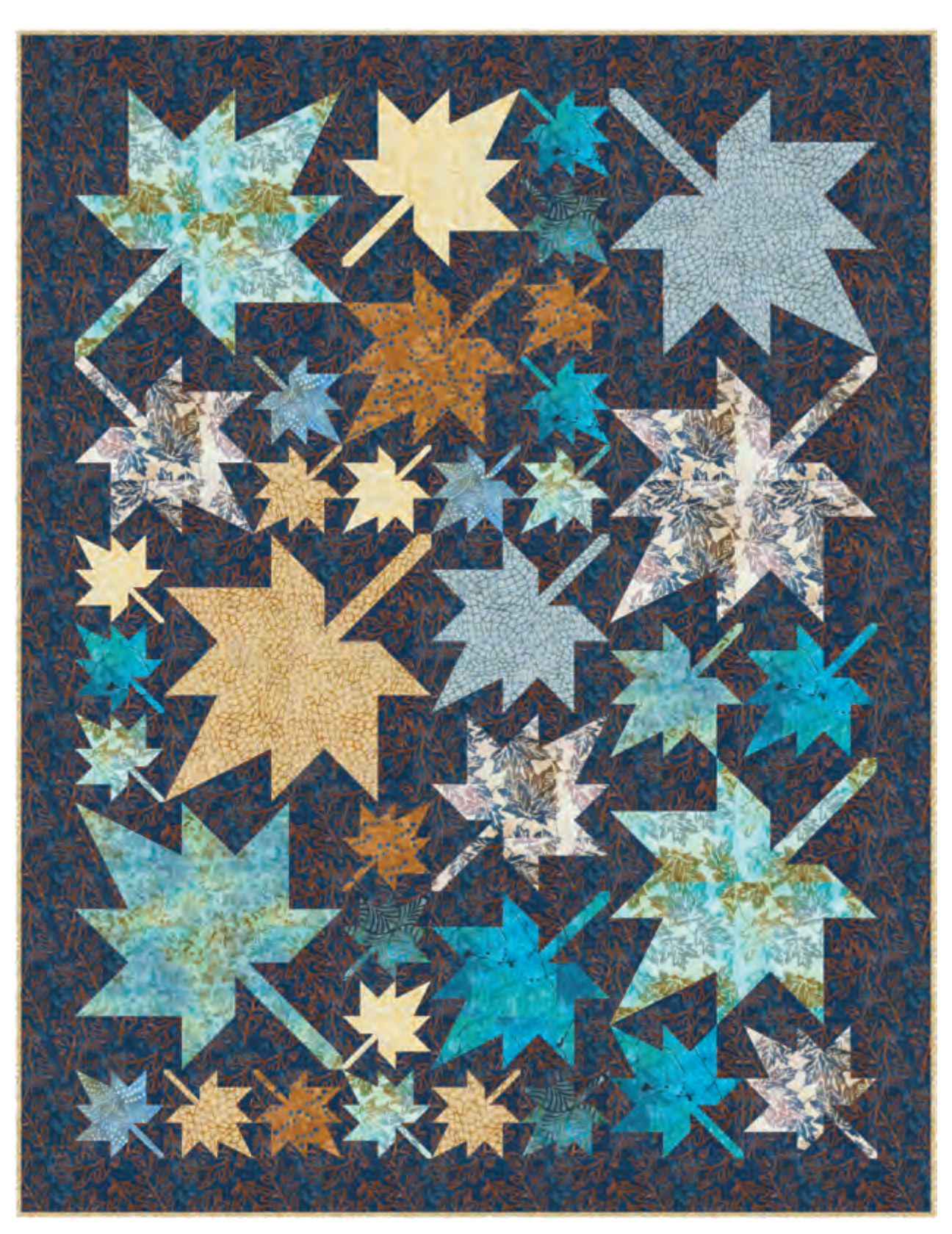
WS 01 Autumn Leaves | 51" x 66" by Wendy Sheppard