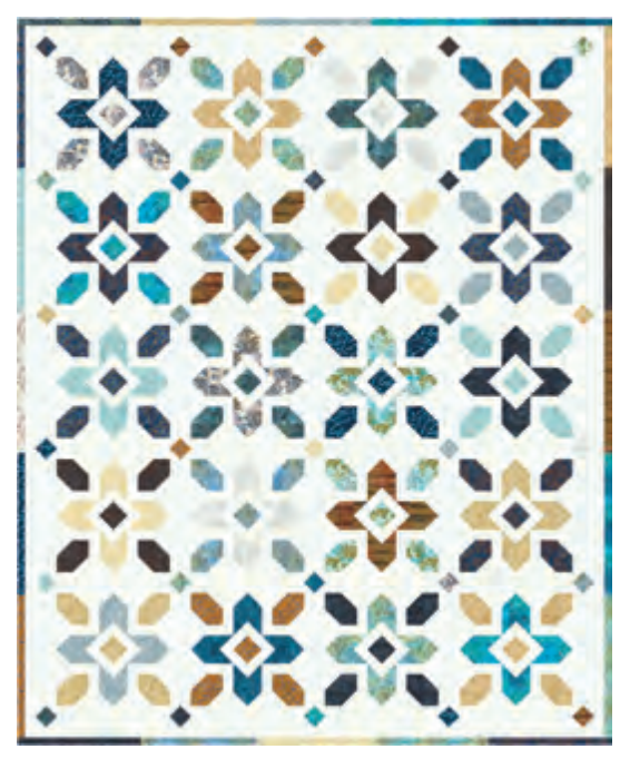
HQ 133 Crossing Paths | 82" x 101" AB Friendly | by Happy Quilting

Capture the beauty and mystery of a misty morning in the Blue Ridge Mountains with Moda's new Blue Ridge Batiks collection. Batik leaves and flowers, dewdrops, and shale stone patterns in organic colors of sand, rust, earth, frost, and mist come together in a collection for all your nature-inspired quilts and projects.