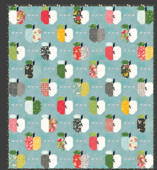
BG PAT068 Apple Dandy 72" x 81" LC Friendly