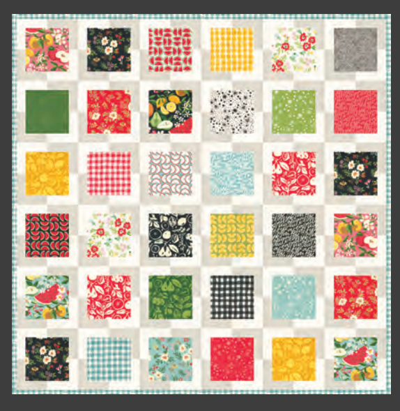
LB 222 Iconic 78" x 78"