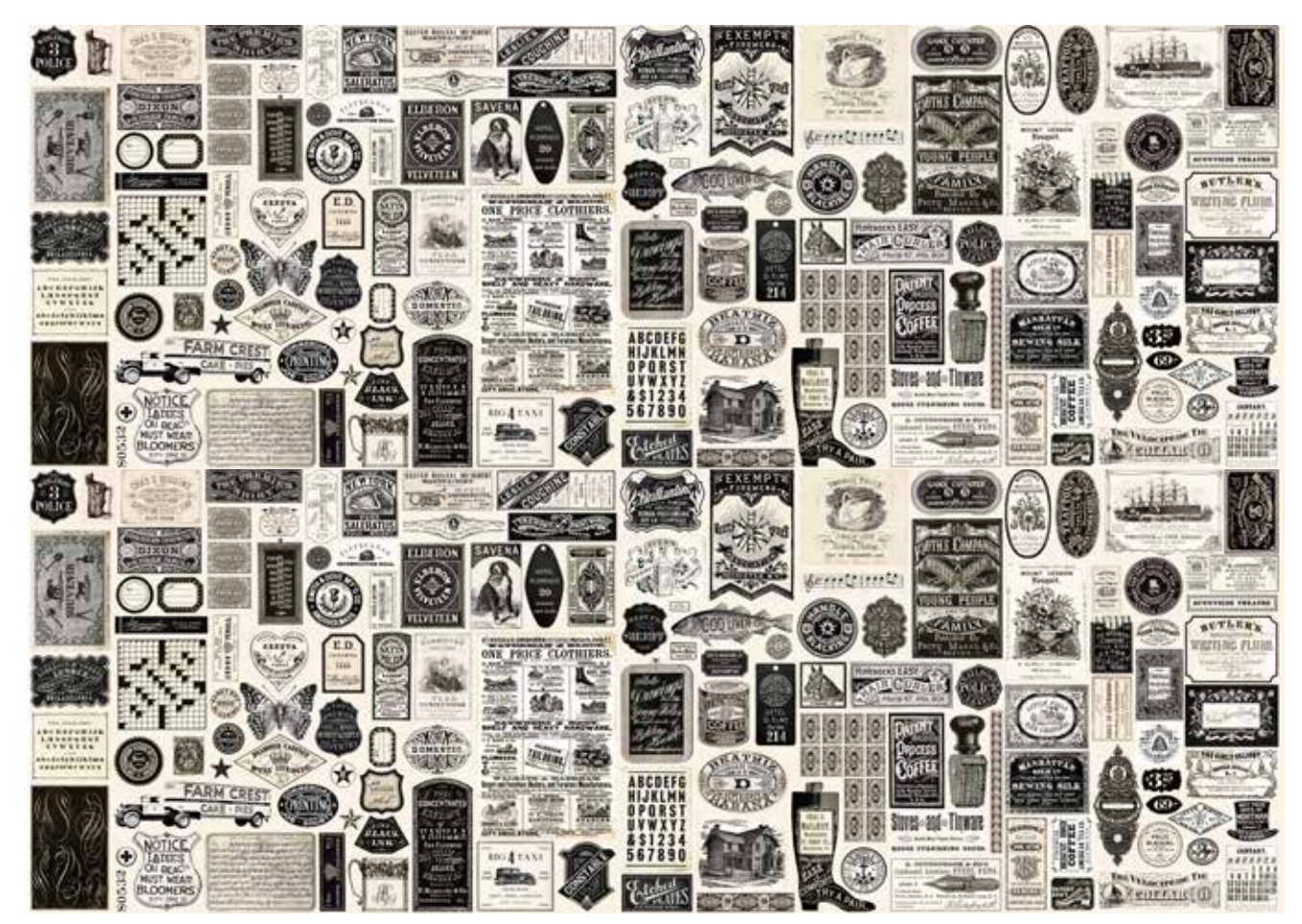
7440 12 Reduced to show full 44" WOF