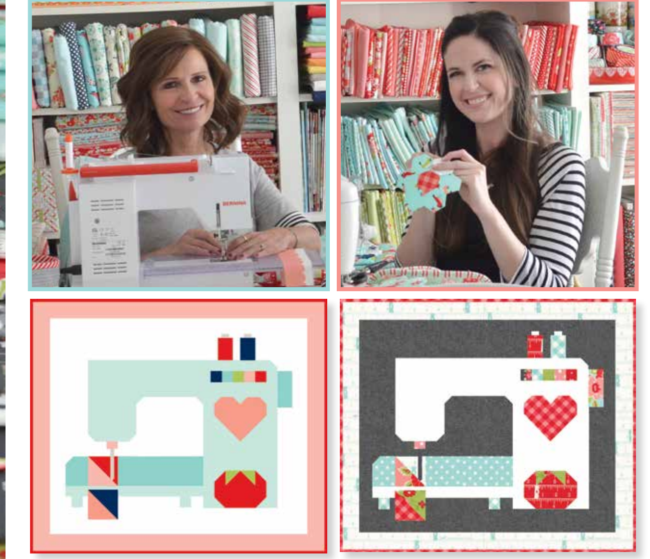
pattern by Thimbleblossoms TB 229 / TB 229G Stitched with Love Solid Size: 17" x 20"