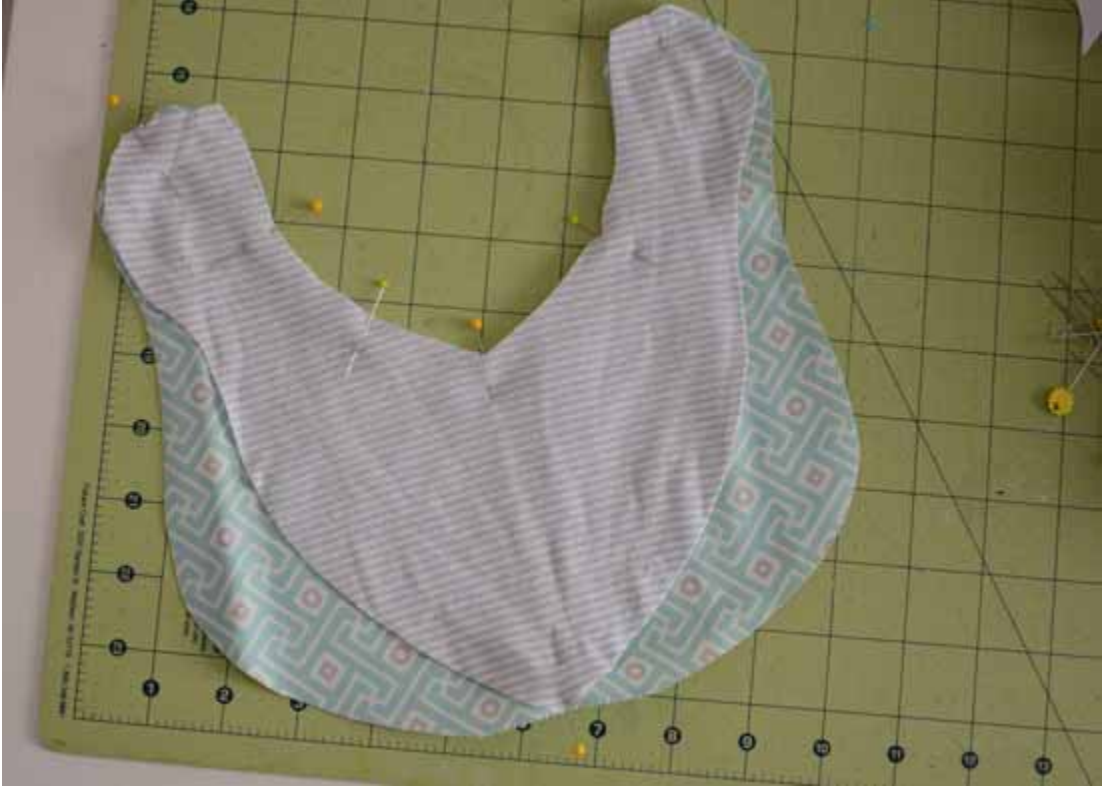
Pin along the edges, gathering in the fullness at the bottom of the scarf.