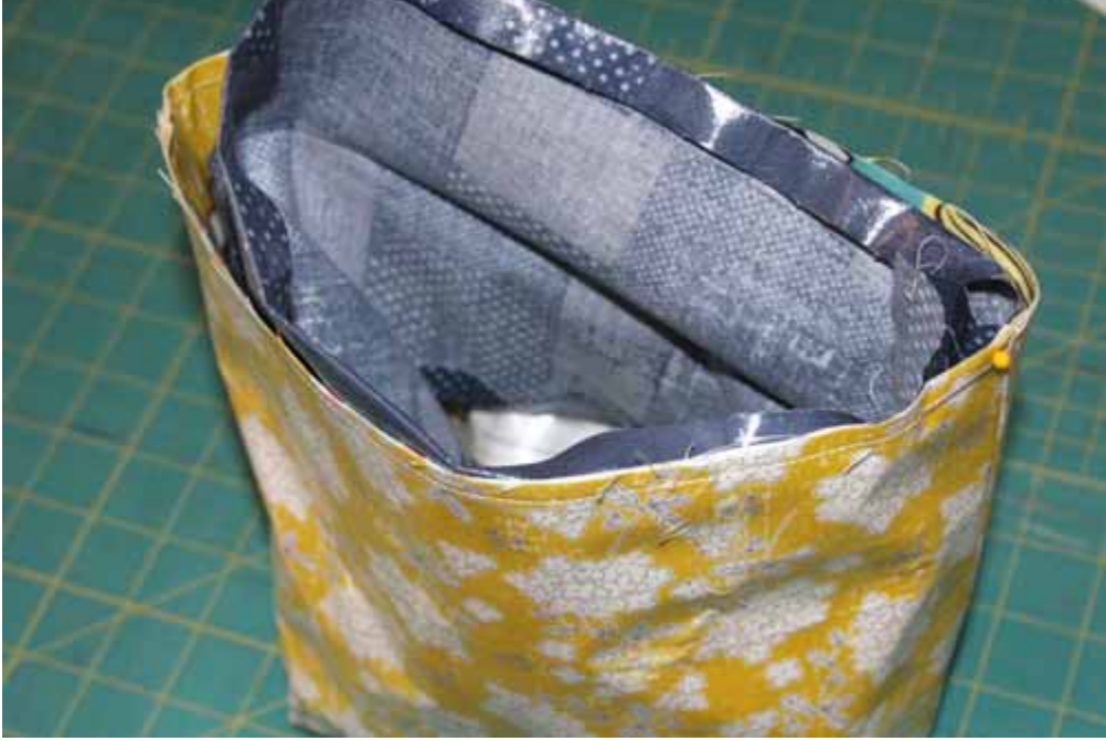
Pin one edge of C (WSO) to the top edge of the outside fabric (RST). Sew all three edges together.