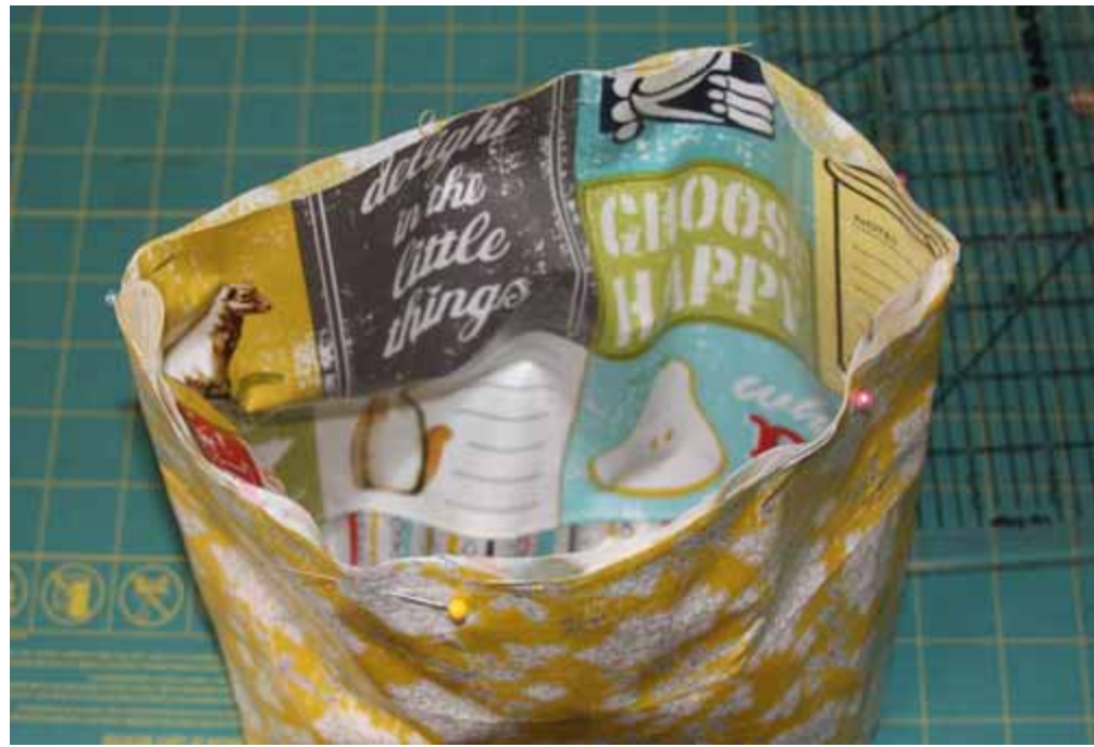
Turn the inside bag so the RSO (right side out), and turn the outside bag to the RSI (right side in) wrong sides are touching. Put the inside fabric inside of the outside fabric, pin and sew the raw edges together.