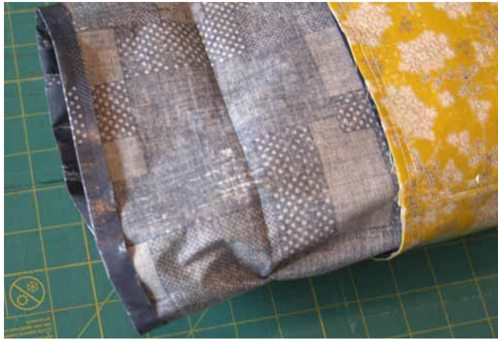
Pull C up and turn down.