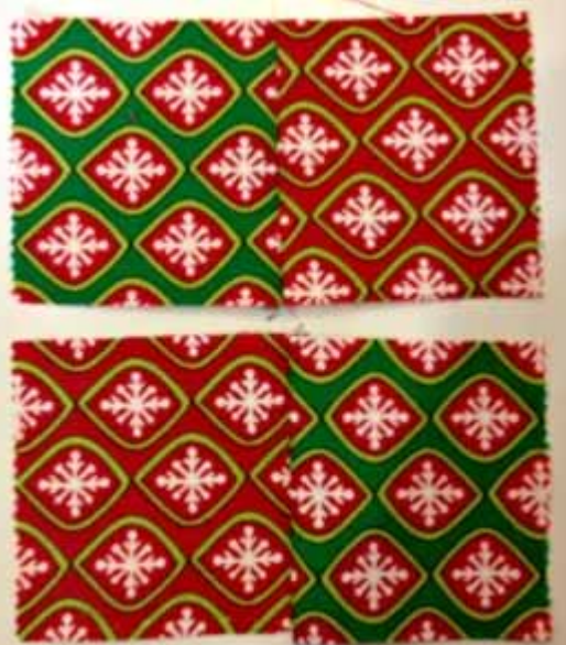
Sew the two rows together.

Make a four patch with the squares by first sewing the rows together. Press seams in opposite directions. These are pressed toward the green.