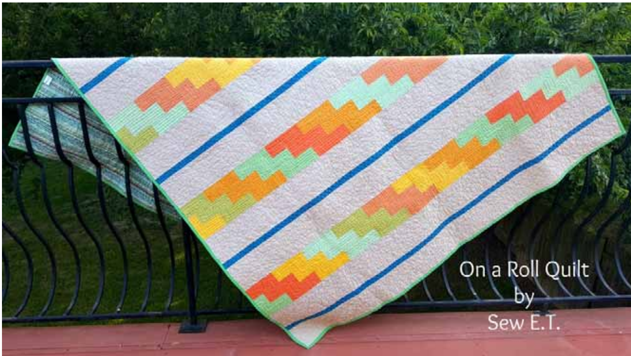
On a Roll Quilt by Sew E.T.