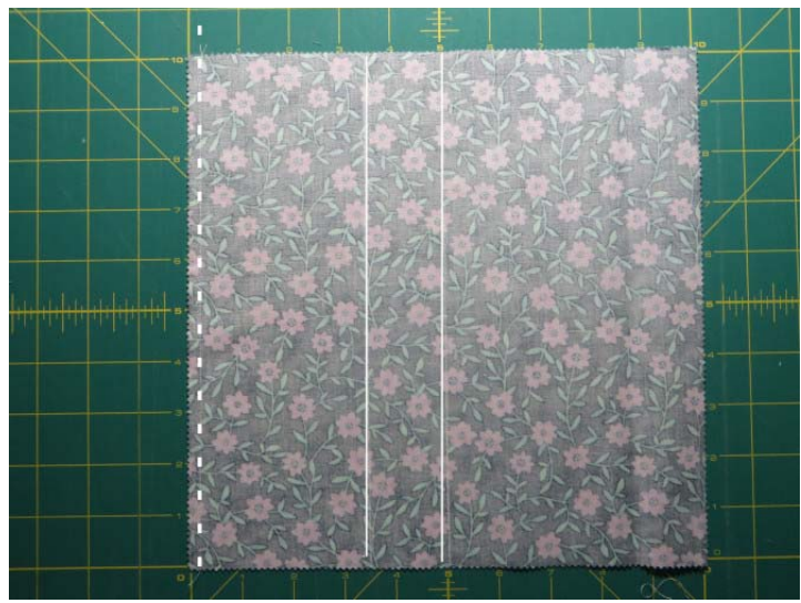
Cut along those lines. You'll have a stitched section, two 1.5" strips and two 5" strips.