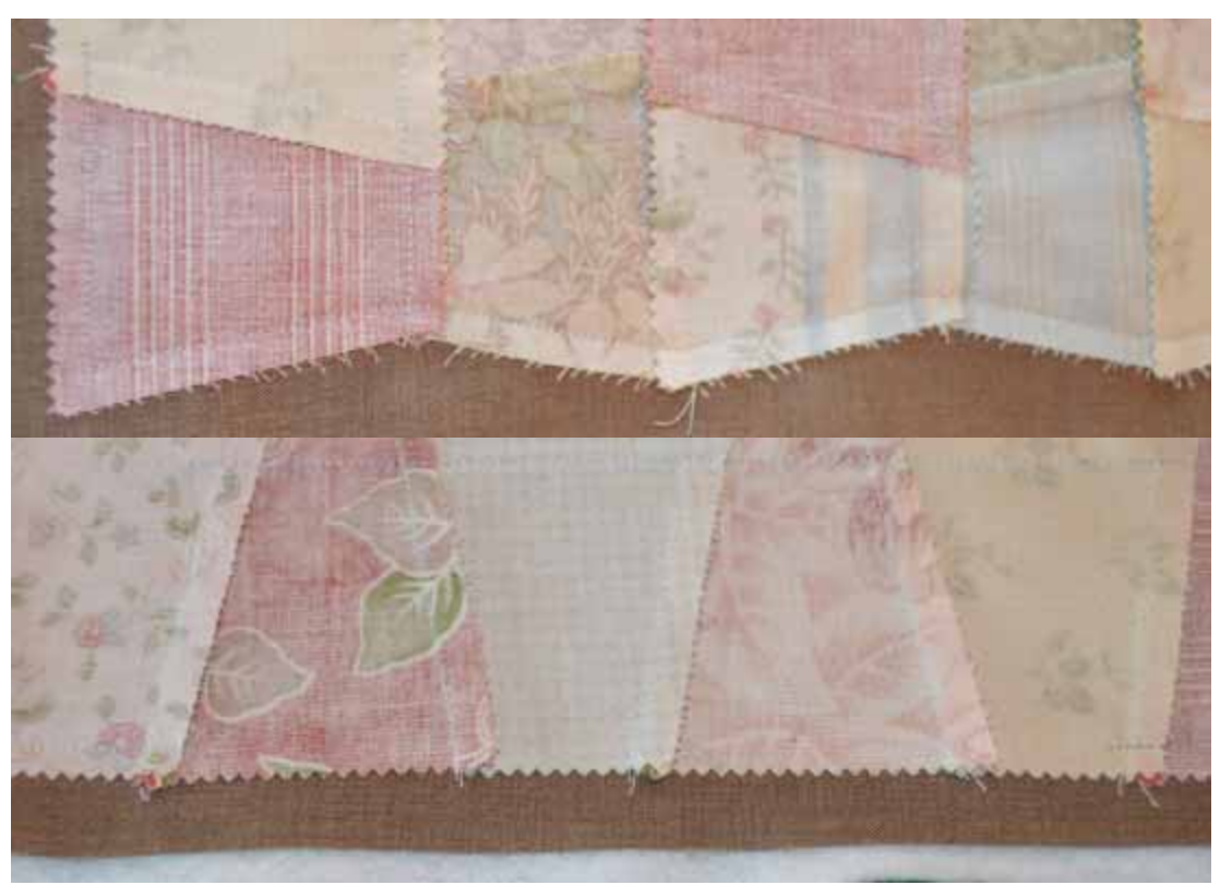
Cut Backing and Batting even with the mug rug. Where you left the opening for turning, leave 1/8" of batting and backing. Round the 4 corners of the mug rug (this will relieve the bulk in the corners).