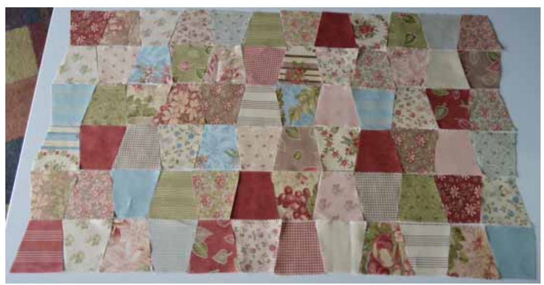
Now it is time to sew! Flip 1 tumbler on top of another tumbler. I flipped the 2nd tumbler on top of the 1st tumbler.