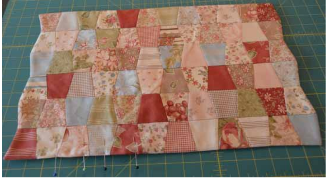
Press and enjoy!

Top stitch 1/8" all the way around the mug rug. When stitching the uneven sides, stitch to the seam line where the 2 rows are joined. Stop with your needle down, pivot, and continue sewing. Quilt as desired. I stitched 1/8" away from the seams. See the Picture.