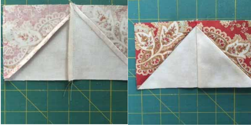
Sew two sets together to make a square. Press seam open. Make 3.

Sew the pieced squares together in groups of two, using one square with the seam pressed toward the outer border print and one pressed toward the light. Make 6 sets.