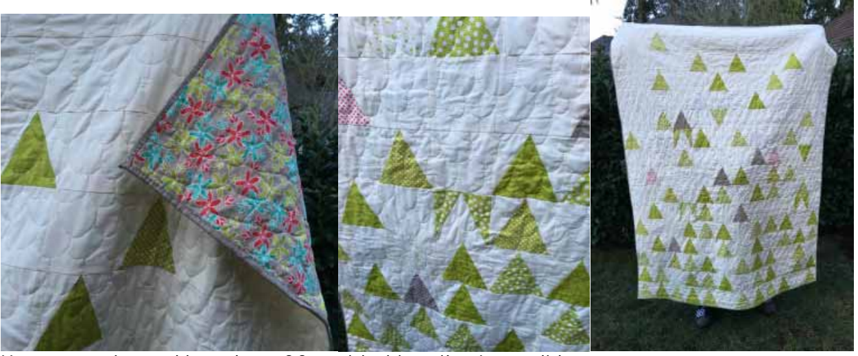
Hope you enjoy and have lots of fun with this quilt. I sure did.

All you have left is to quilt it (I choose to use one of the patterns from the clover material which reminded me of garlands hanging on a tree) and then bind it.