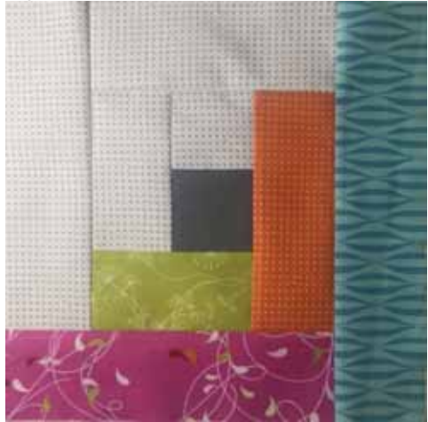
Make a total of 44 print squares.

Sew a 2\frac{1}{2} " x 8\frac{1}{2} " print rectangle to the bottom. Press seam towards the print rectangle. Sew a 2\frac{1}{2} " x 10\frac{1}{2} " print rectangle to the right side. Press seam towards the print rectangle. Proof square to 10\frac{1}{2} ".