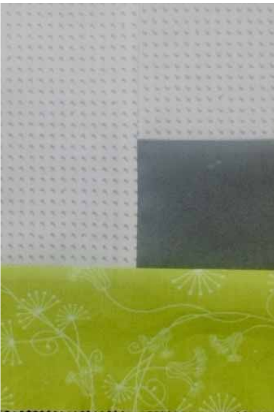
Sew a 2½" x 6½" print rectangle (cut from your jelly roll) to the right side. Press seam towards the print rectangle. Proof square to 6½".