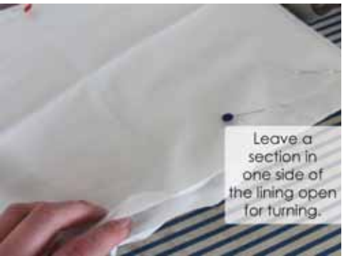
Sew a 1/4" seam down both sides, being sure to leave an opening on one side in the lining. Turn right sides out and gently push out corners. Slip stitch the hole in the lining closed. Top stitch along top of bag to secure lining in place.

From here, it's like making a pouch ... with right sides together, line up the top seams we just sewed and pin. All the lining should be to one side and all of the exterior to the other. Pin down each side, matching the patchwork panels on the exterior, and leaving a 5" area on one side of the lining open so we can turn it later.