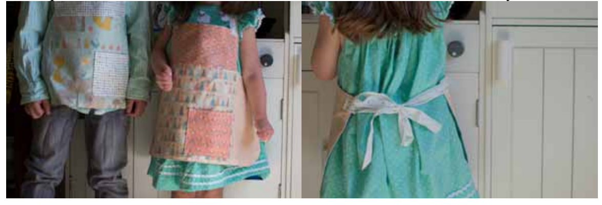
Lisa Calle {Vintage Modern Quilts}

Each apron measures about 13" tall x 16" wide and fits most children 2 to 5 years old.