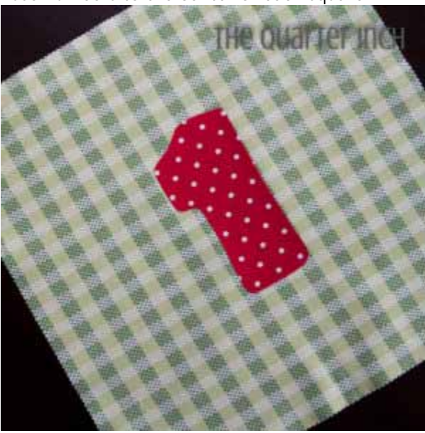
If desired, blanket stitch or zig zag stitch around each number.

Fuse numbers to the center of each square.