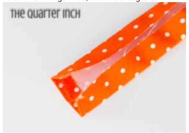
Stitch 1/8" on each side.

Take the two 2 ½" by WOF strips. Fold ends in ¼". Stitch 1/8" from folded edge. Fold in half lengthwise, then fold edges to meet in the center. Press.