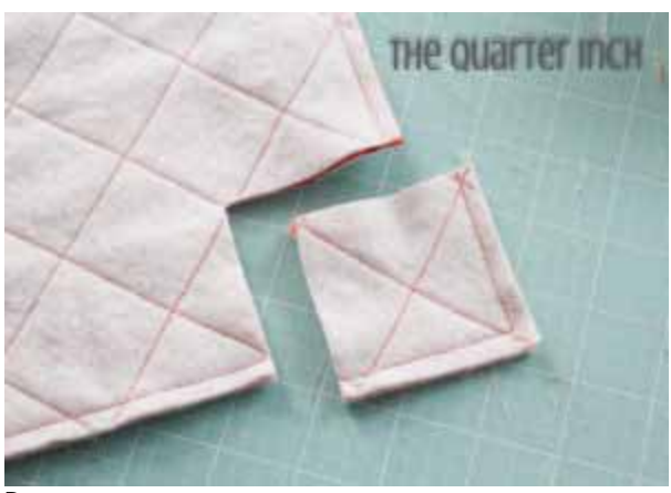
Press seams open. Line up the seams. Pin closed.