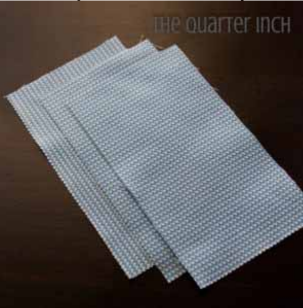
Fold ½" over on the top and bottom Fold in half, right sides together, with folds on the outside.

Take four layer cake squares, each a different color. From each layer cake, cut three 3 ½" by 6 ½" rectangles.