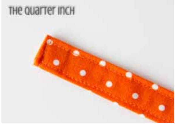
Repeat for the other tie. Set aside.