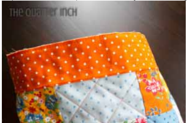
Nestle the lining in the bag.

Line up the raw edges of the bag flaps and the top of the outside of the bag. Using a long stitch length, baste the bag flaps to the outside piece, 1/8" away from the edge.