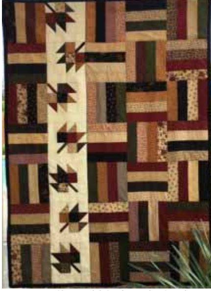
Baste, quilt and bind as desired. This lap quilt finishes at 42" x 58". Hope you enjoy and have lots of fun making this quilt. If you get a chance, stop by and visit me at <u>Just Because</u> Quilts. I love to make new friends!

Complete your quilt top by sewing together the Maple Leaf row to the lone Rail Fence row, then sewing this section to the 3-row Rail Fence section.