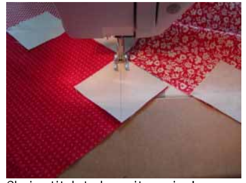
Chain stitch to keep it moving!

Sew the 3" squares to each corner of a Layer Cake square on the diagonal line as shown in Example 1.