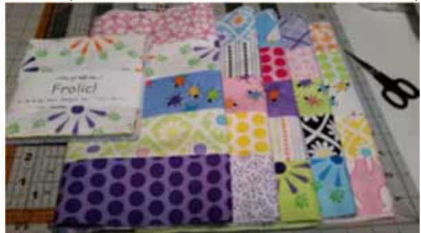
Next, cut each row into 4 blocks that measure 10" x 10". (see below)

Sew each set of five together so that you have 5 rows of strips, each measuring approximately 10 1/2" x width of fabric. (see below - note, these have been folded)